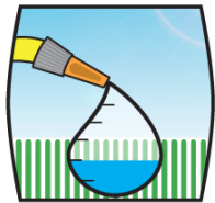
Low Water Needs