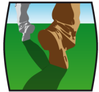
Excellent Traffic Tolerance