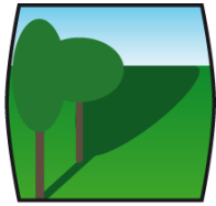
High Shade Tolerance